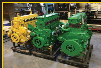
Rebuilt Long Blocks for Deere Skidders Tier 2, 3 and 4

OUR MOTTO IS SIMPLE: Treat Others Like We Would Want To Be Treated