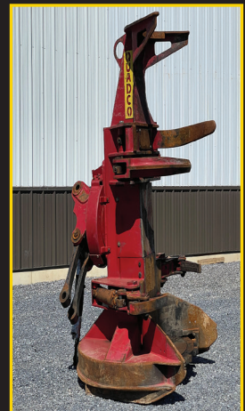
Quadco 22B Head w/ 360 Rotation off Timbco Also have boom mount for CAT/Timberking $25,000