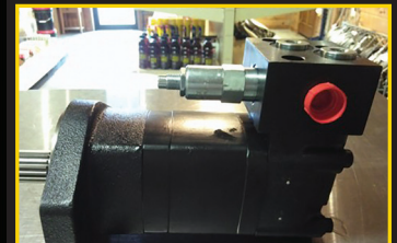
Grapple Rotate motors for Deere Skidders Series G thru H

Direct Fit no adaptors or fittings needed Proven Design, sold over 1200 Units Unlike OEM Pump, this is completely rebuildable. The parts are available at most hydraulic distributors