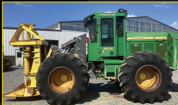
JD 843K w/ FD55 sawhead $39,000

BARKO: 160A, 160B, 160D, 275B, 350. CAT: 508, 515, 518, 525, 525B, 525C, 545, 711. CASE: 300C. CLARK: G67, 665D, 666D. FABTEK: 153. FRANKLIN: 100, 105, 130, 132, 142, 160B, 170, 405, 462, Q80. HUSKY: 335. HYDRO-AX: 221, 411, 611E, 711E. IH: S7, S8. SKIDMASTER: SK80. JD: 435, 437C, 440A, 440B, 440C, 540A, 540B, 548D, 548E, 548G, 548GII, 634K, 640, 643D, 648D, 640E, 648E, 648G, 648GII, 648GIII, 648H, 653E, 748E, 748G, 748H, 753J, 843K, 848G. PEERLESS: 2170. PRENTICE: 120, 150, 180, 210B, 210C, 210E, 280, 310E, 325, 384, 410D. TJ: 208, 230, 230D, 240, 240D, 240A, 330, 380, 450, 360, 460, 560, 660, 660D, 608S, 850, 1270 Harvester. TIGERCAT: 610, 630B. TIMBERKING: 540, 722. TIMBERPRO: 725B. TIMBCO: 2518, 425B, 425C, 425D, T435, 445D, 425EXL Bar Saw Head. TREEFARMER: C4, C5C, C5D, C6C, C6D, C7D, C7F. Bell Ultra T & Bell Super T. MORBARK Wolverine. Rolly Processing Head: TJ 762B Head.