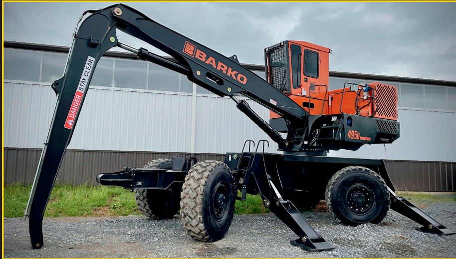
NEW BARKO 495RTC IN STOCK! THE ULTIMATE MILL YARD LOADER

We continue to offer quality used parts for all makes