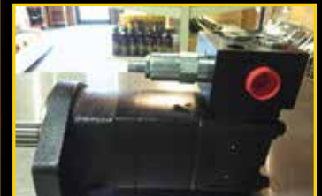
Grapple Rotate motors for Deere Skidders Series G thru H

Direct Fit no adaptors or fittings needed Proven Design, sold over 1200 Units Unlike OEM Pump, this is completely rebuildable. The parts are available at most hydraulic distributors