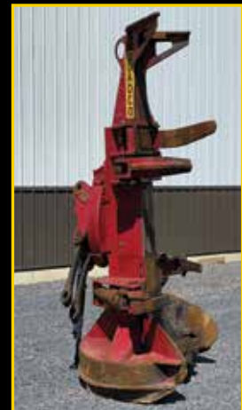
Quadco 22B Head w/ 360 Rotation off Timbco Also have boom mount for CAT/Timberking $25,000